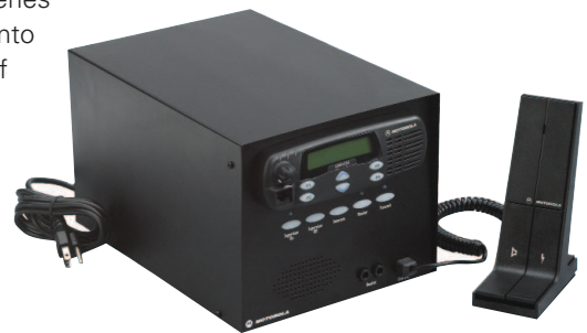
Control Station (RLN5403A) and Desktop Microphone (RMN5068A), shown with a CDM1250, all sold separately.

The CDM Control Station converts a CDM Professional Series mobile into a convenient base station. The radio mounts into the lightweight, portable chassis, containing a full range of front panel control buttons plus an internal microphone, speaker and power supply. A front connector allows for a range of external audio accessories; including a desk microphone, tone or DC remote adapter and telephone interconnect. Additional desktop tray and microphone options are available for simple base station operation.