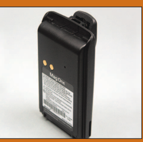
Mag One 1200mAh NiMH Battery PMNN4071_R