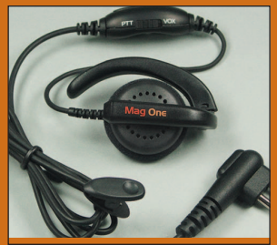
Mag One Ear Receiver with In-line Microphone and PTT/VOX Switch PMLN4443_B